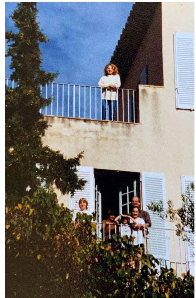
FORMER FELLOWS WITH THEIR FAMILY IN 1996

sustainable arts foundation SUPPORTING ARTISTS AND WRITERS WITH CHILDREN